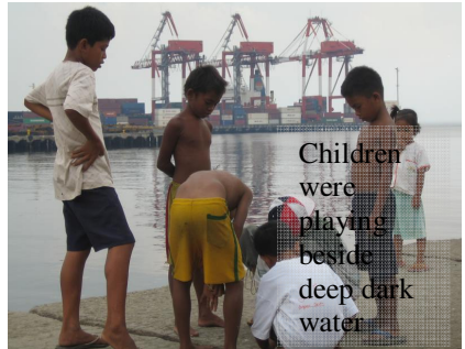
Children were playing beside deep dark water

“How is your Philippines trip?” asked the church members. My reply was “How did you know I have been to the Philippines?” Never would I have thought that my email would be posted in The Vine! Due to the first little “contribution”, I must continue my contribution to The Vine, to provide an full report on my trip to the Philippines.