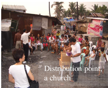
Distribution point, a church

After the adventure of various transportation modes, we reached the