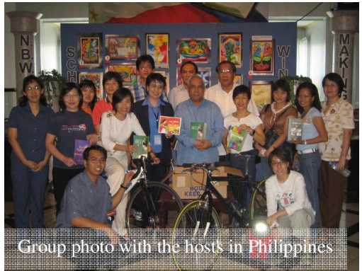
Group photo with the hosts in Philippines

On the day of our arrival, we visited the Philippines Bible Society and had lunch there. We proceeded to the slum area in Metro Manila, BASECO (Bataan Shipyard and Engineering Company). This is a crowded housing area next to a port.