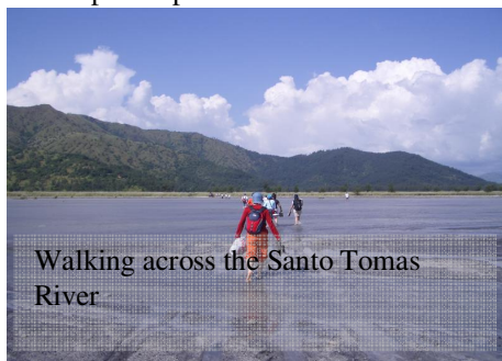
Walking across the Santo Tomas River

Santa Fe was our next distribution. As the jeepney was cruising through the wasteland resulting from the volcano eruption to get closer to the Santa Fe, our journey was blocked by a river, the Santo Tomas River. Therefore, we had to leave the jeepney, take off our shoes, roll up our pants and walk across the